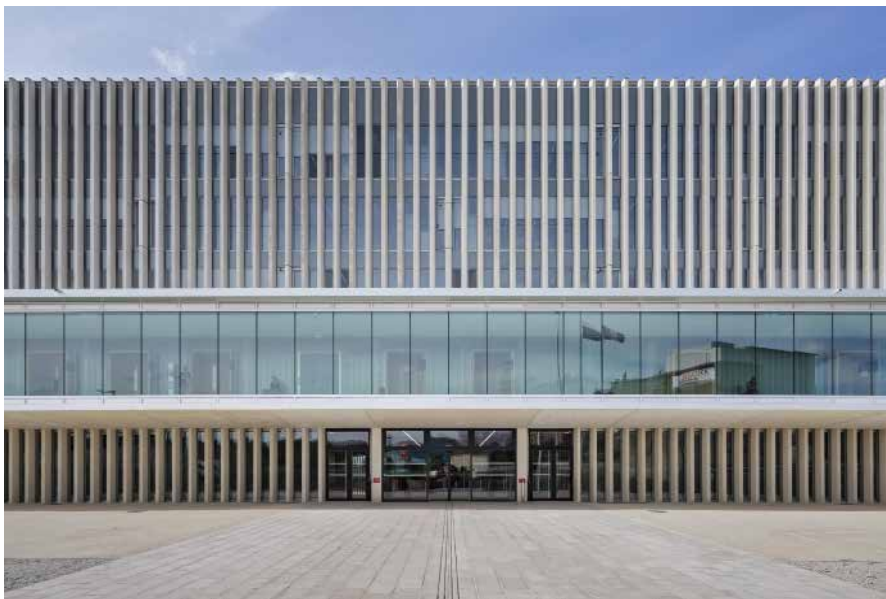
archphoto inc. © baumschlager eberle