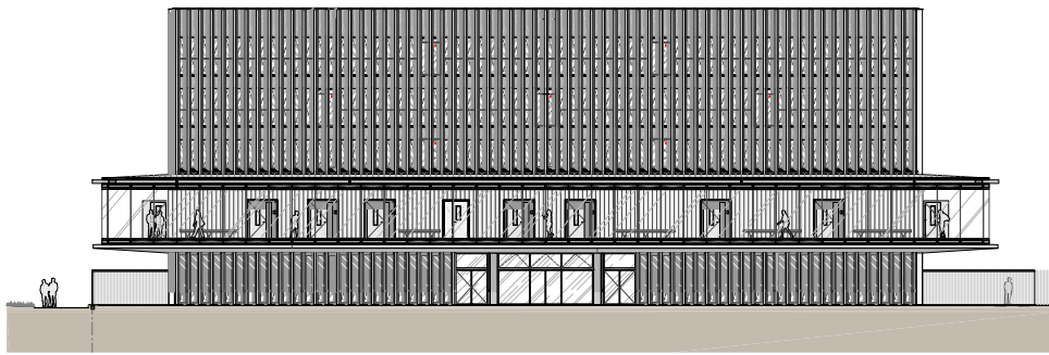
south facade 1:500