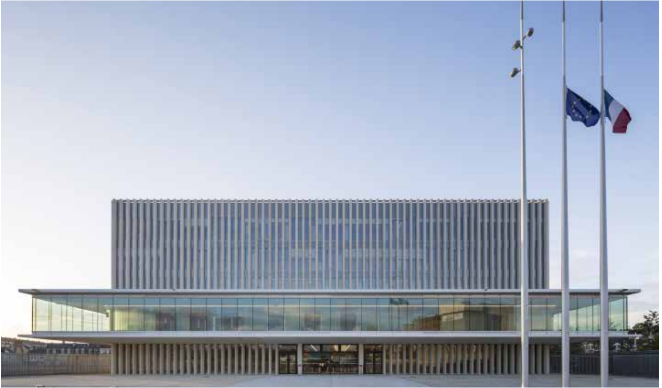
„New Law Courts“, Caen, France Baumschlager Eberle Architectes, Atelier Pierre Champenois, archphoto inc. © baumschlager eberle