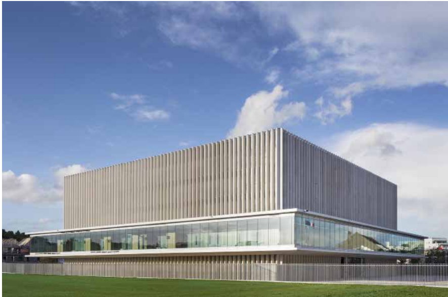
archphoto inc. © baumschlager eberle